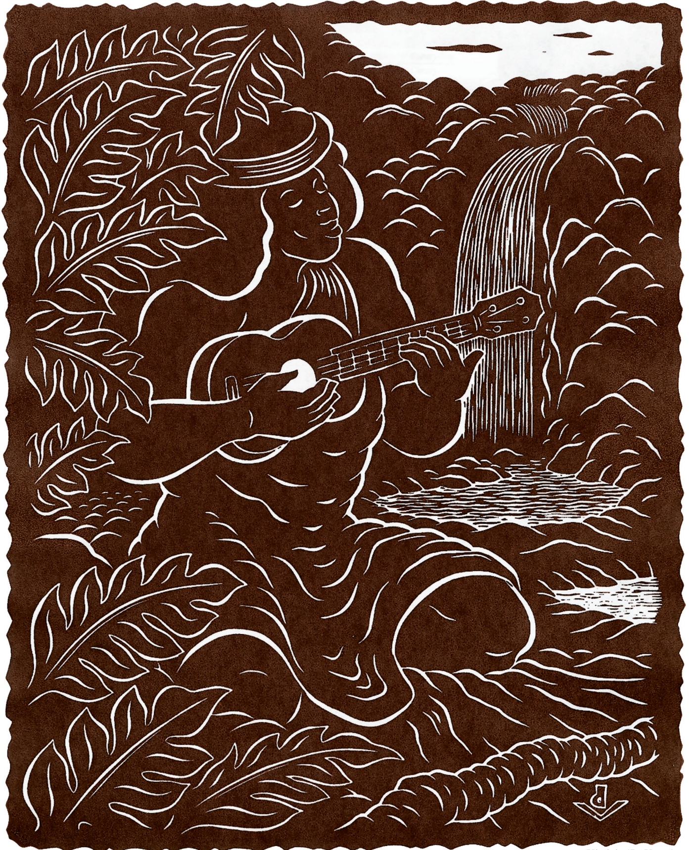
Ukulele (D. Varez)