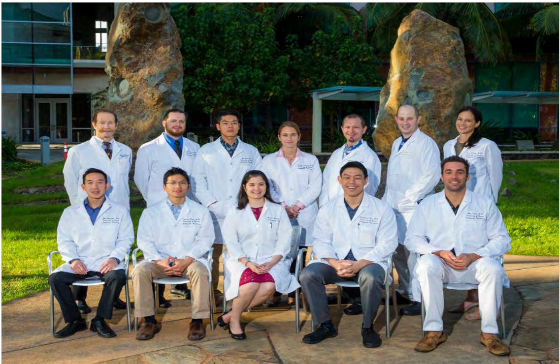
Orthopaedic Residents 2015-16