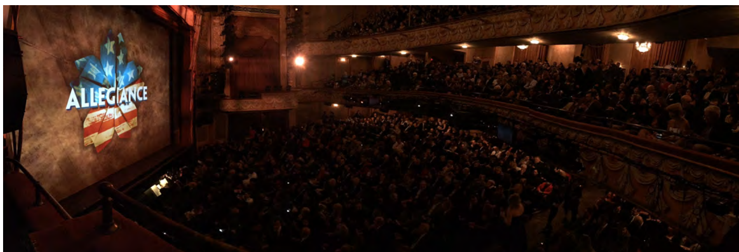
Inside of the House on Opening Night