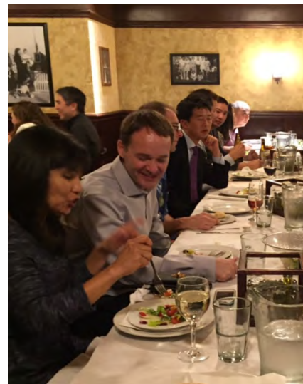
Guests enjoying each other's company and the delicious food.