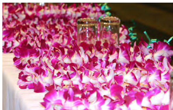
What makes a conference in Hawaii special